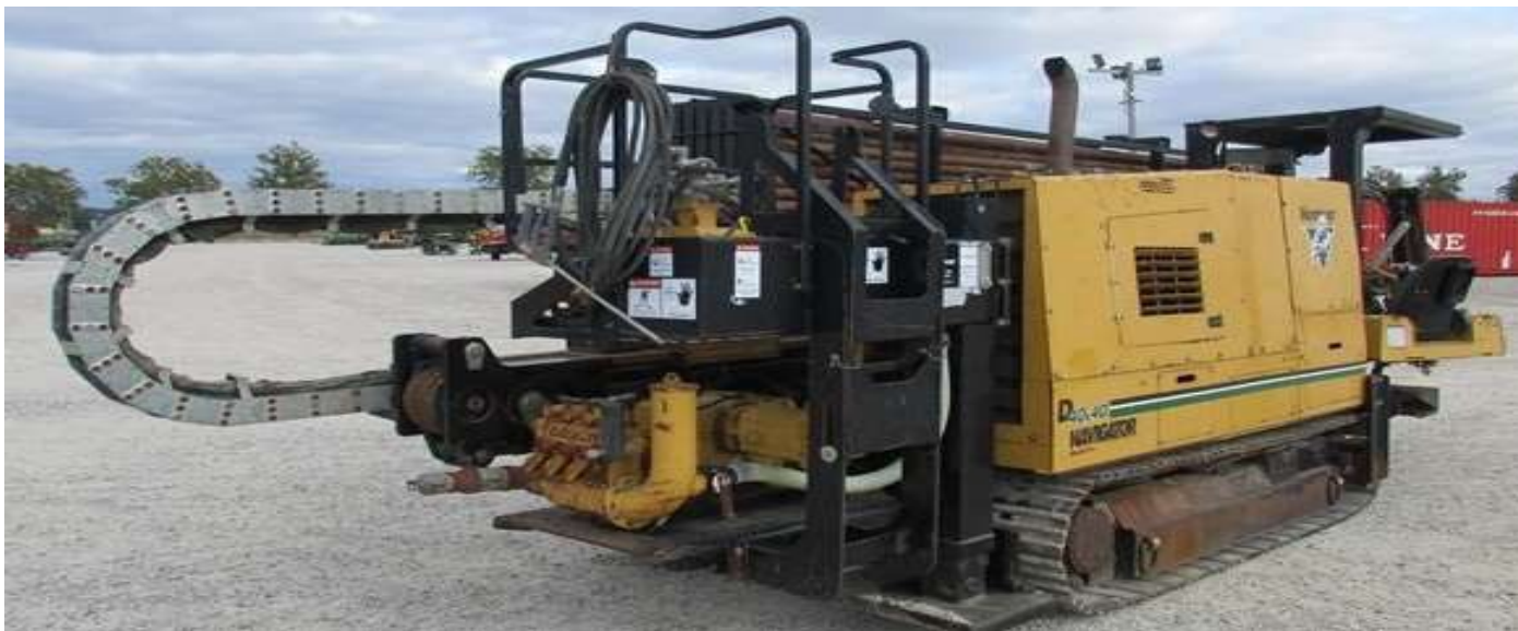
H.D.D. MACHINE (VERMEER D-80 X 100 SERIES II)