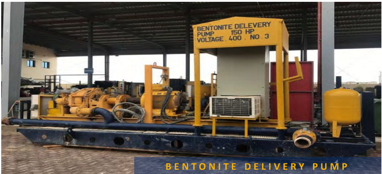
BENTONITE DELIVERY PUMP