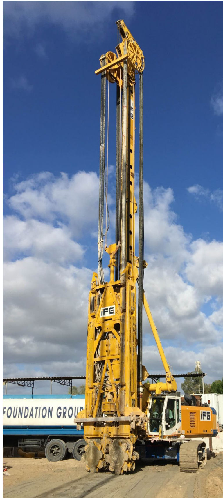
DIAPHRAGM WALL CUTTER MACHINE