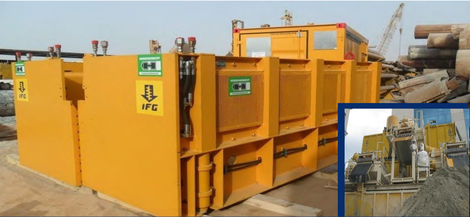
SEPARATION / DESANDER PLANT