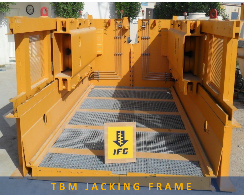
TBM JACKING FRAME