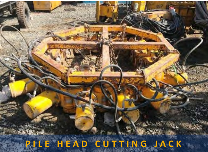
PILE HEAD CUTTING JACK