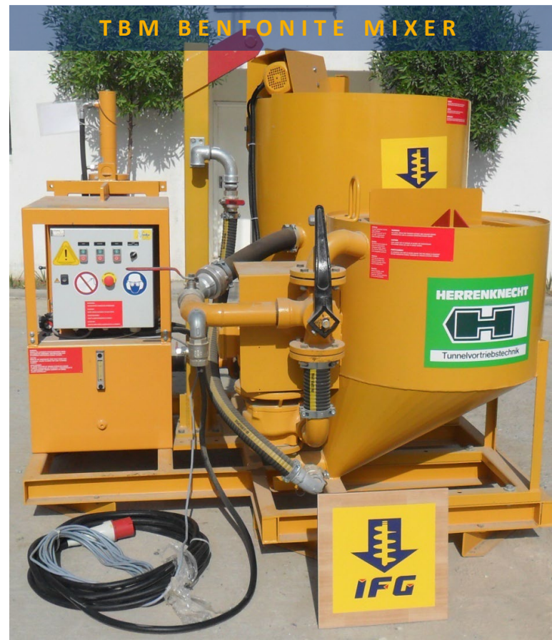
TBM BENTONITE MIXER