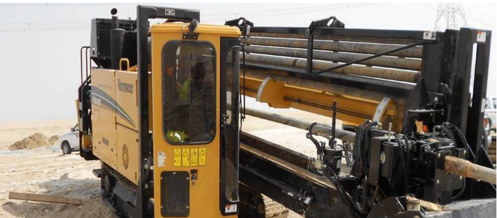
H.D.D. MACHINE (VERMEER D-100X120)