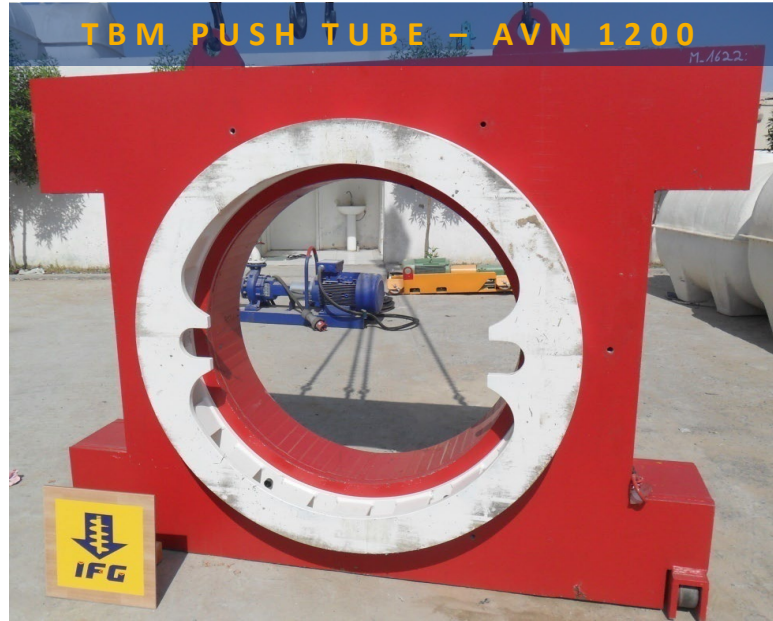
TBM PUSH TUBE - AVN 1200