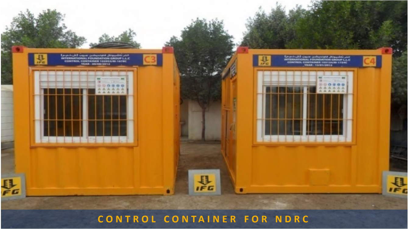
CONTROL CONTAINER FOR NDRC