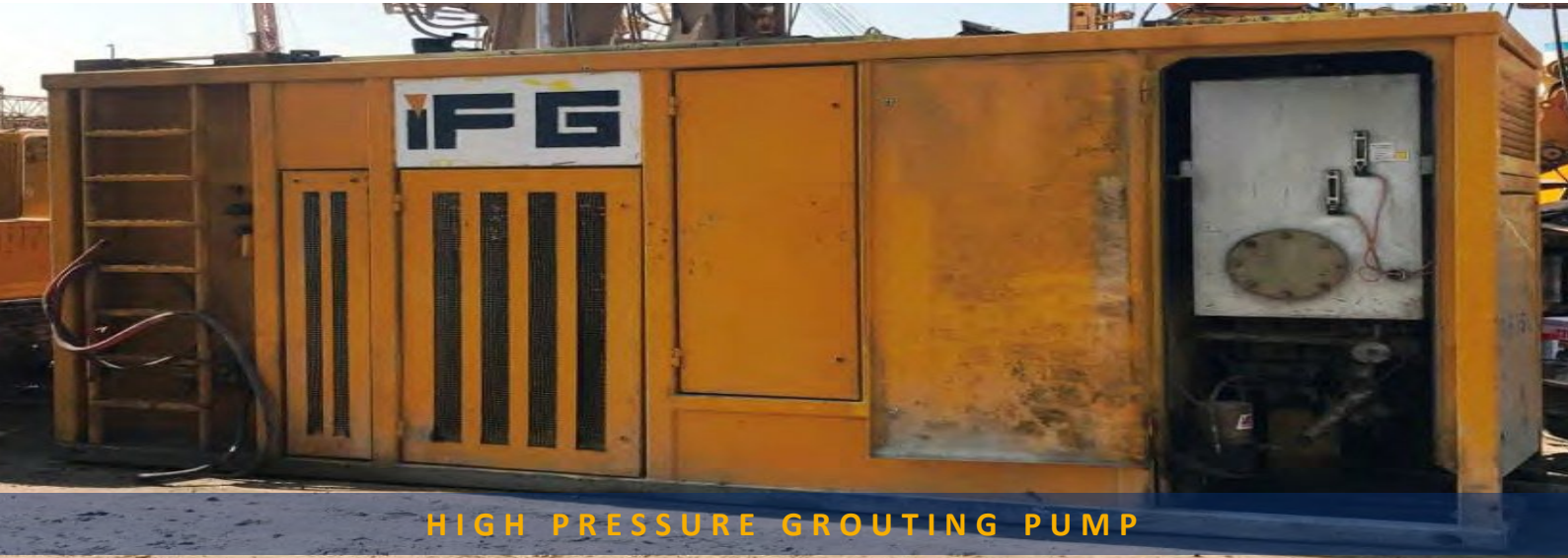
HIGH PRESSURE GROUTING PUMP